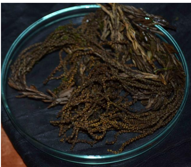
Fig.9: Preservation of spore bank of H. phyllantha