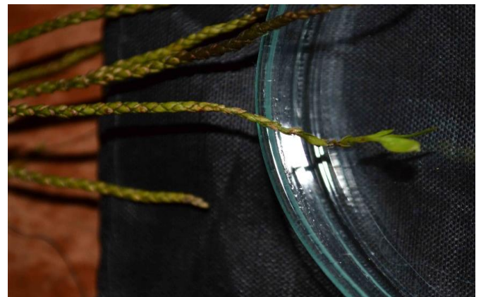
Fig.6: Regeneration of H. phyllantha