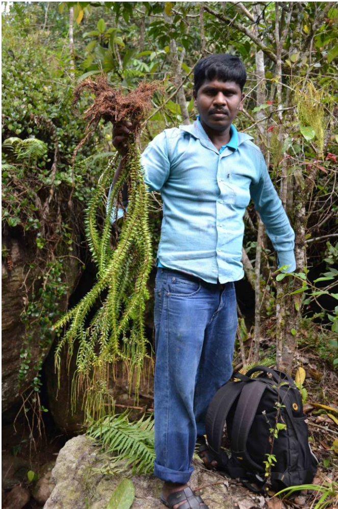
Photo-4: Field observation of Huperzia species from Upper Kodaiyar Dam

The life cycle of Huperzia species have two-stage of life cycle (diplohaplontic) with the sporophyte being the most dominant and obvious life form. Upon germination, the spores of Huperzia species give rise to bisexual gametophytes which can be rather small (~9mm) size, green color and irregularly shaped. The development and maturation of archegonia and antheridia in gametophytes of Huperzia species was formed up to 15 years. Water is a requirement for fertilization. The sporangia, which contain the spores, are borne either singly, in leaf axils or packed together in a strobilus or cone (Raven et al. , 2004).