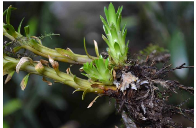
Photo -2: Vegetative regeneration of H. phyllantha from Muthukulivayal