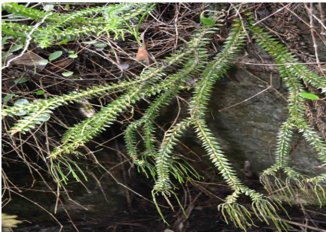
Fig.8: Natural view of spore bank of H. phyllantha